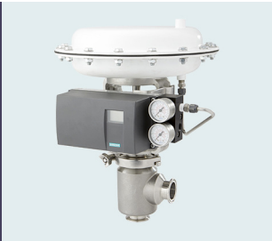
FBCV-OR Sanitary Control Valve*

Control Valves Sanitary and Utility *3A Sanitary Valves