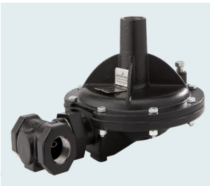
Mark 608IS Gas Pressure Regulator