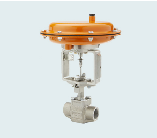
Mark 708 Fractional Flow Valve