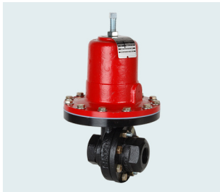
Mark 60 Pressure Regulator