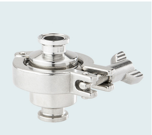
Mark 93 Sanitary Steam Trap