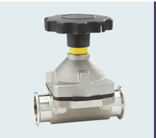
Cast Body Diaphragm Valves

Sanitary Accessories Safety Relief Valves, Steam Traps & Diaphragm Valves