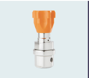
JR Series Pressure Regulator

Pressure, Back Pressure & Gas Regulators Utility (steam/liquid/gas)