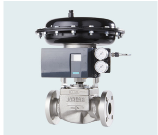
Mark 78 Globe Control Valve