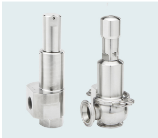
Safety Relief Valves