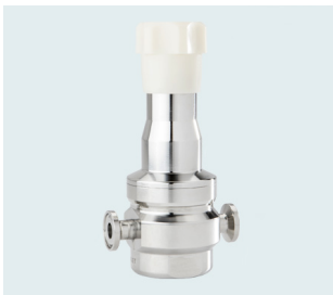
JSR High Purity Pressure Regulator