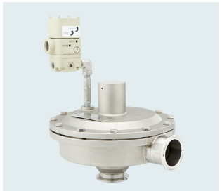
FBCPM Back Pressure Regulator*