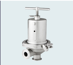
FB6C Sanitary Regulator*

Pressure Regulators & Back Pressure Regulators *3A Sanitary Valves